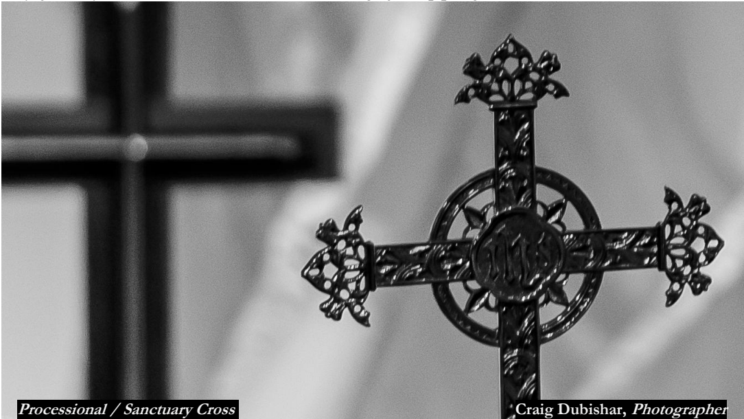
Processional / Sanctuary Cross