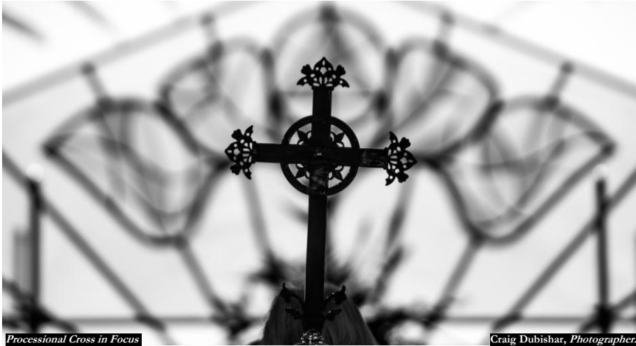
Processional Cross in Focus