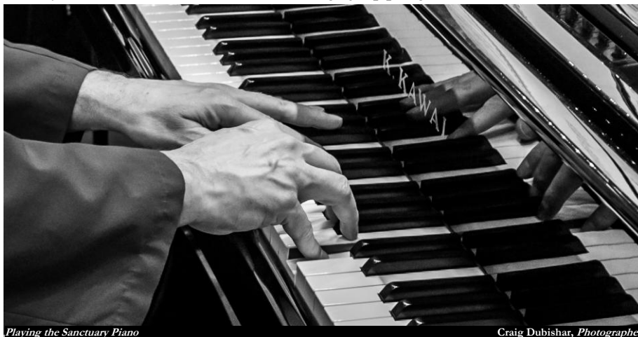
Playing the Sanctuary Piano