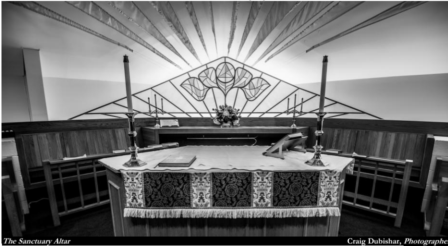
The Sanctuary Altar