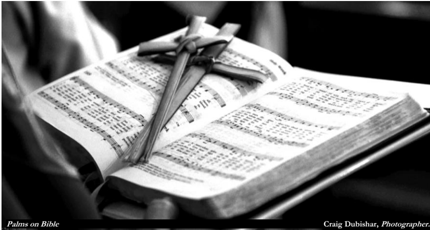
Palms on Bible