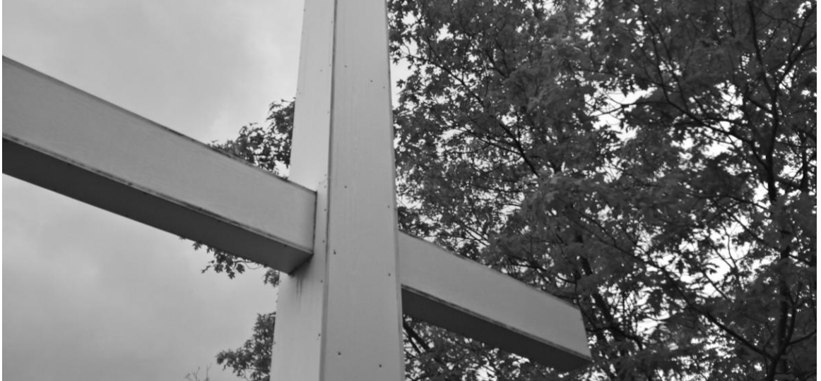
Cross @ Shrine Mont