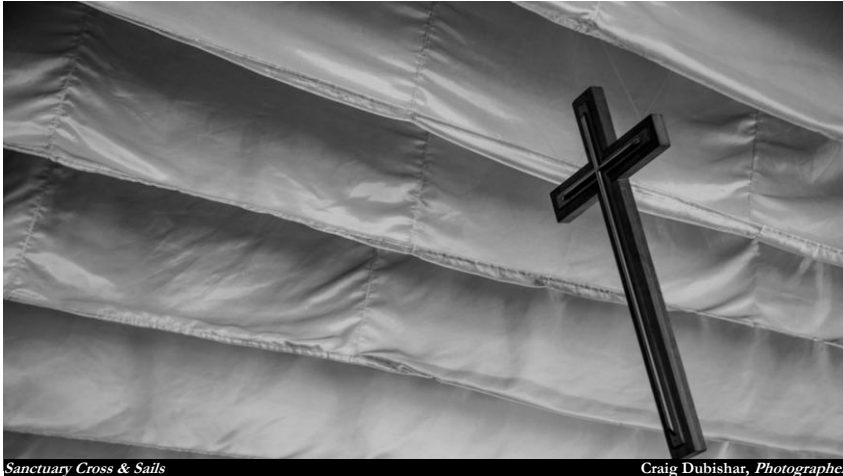
Sanctuary Cross & Sails