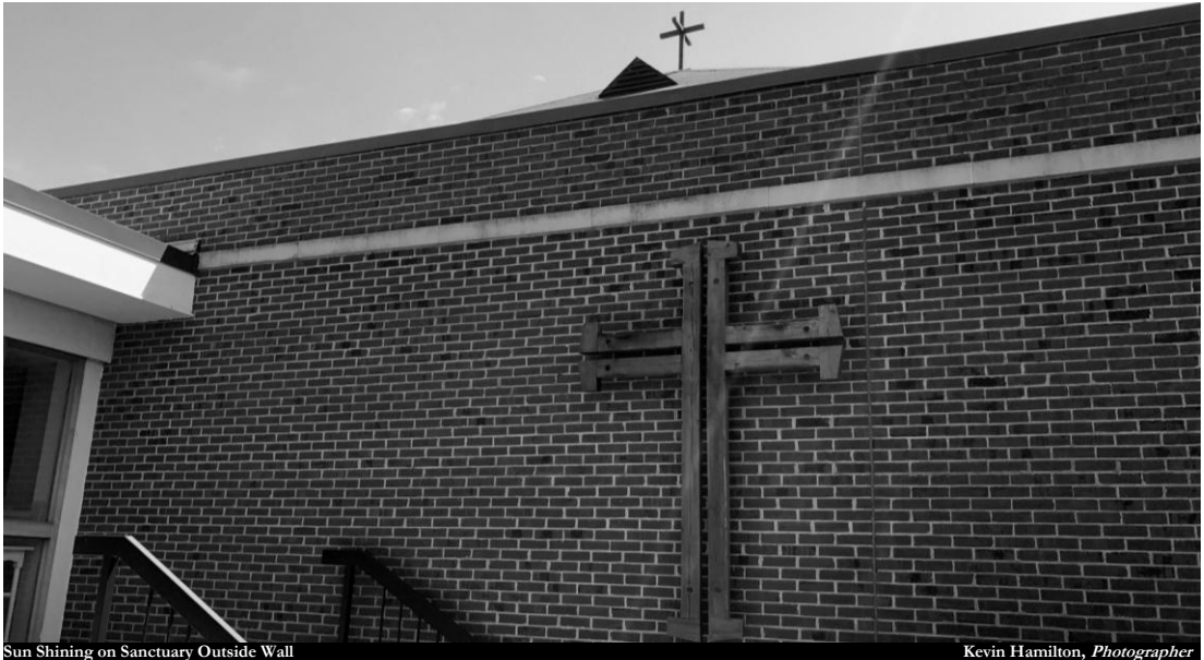
Sun Shining on Sanctuary Outside Wall