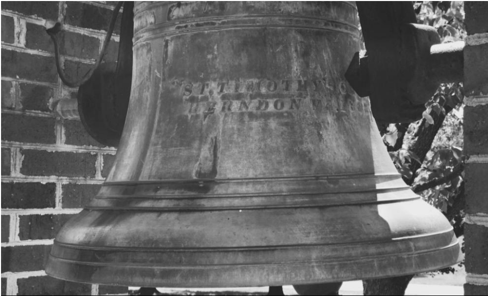
Saint Timothy's Church Bell