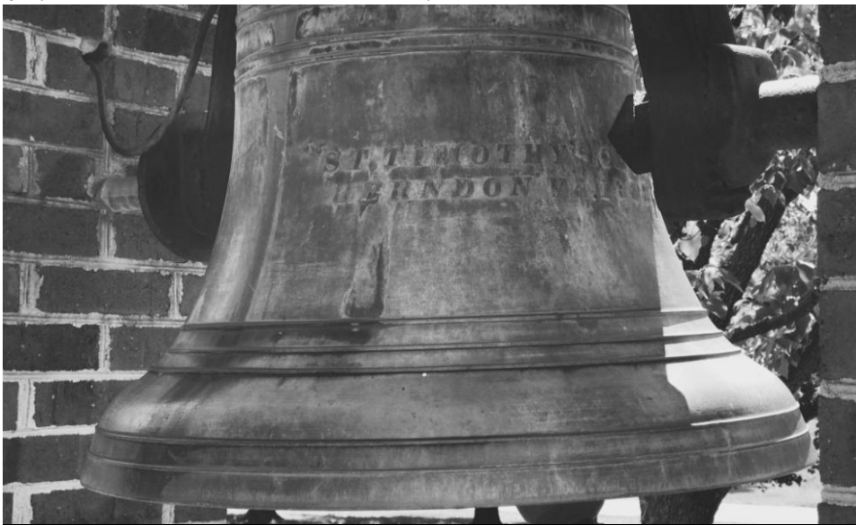
Saint Timothy's Church Bell