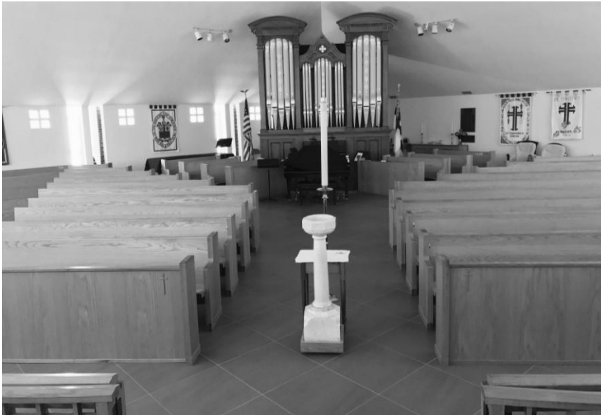
A View from the Chancel