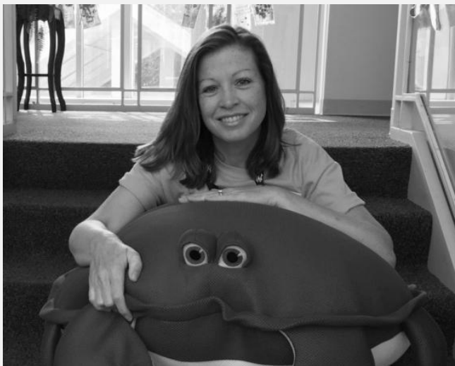
Picture taken during 2016 VBS.