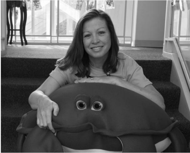
Picture taken during 2016 VBS.