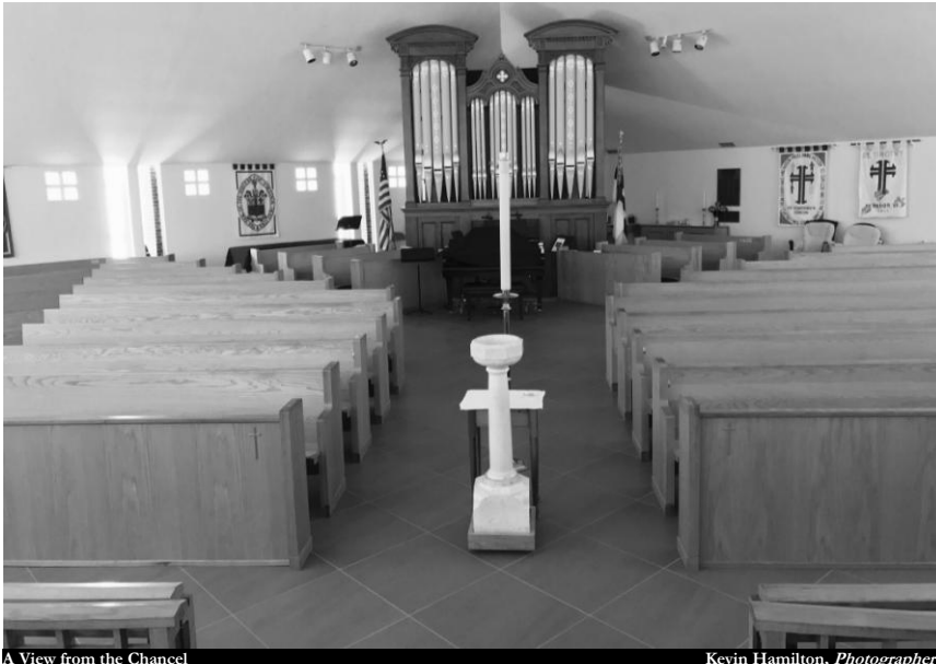
A View from the Chancel