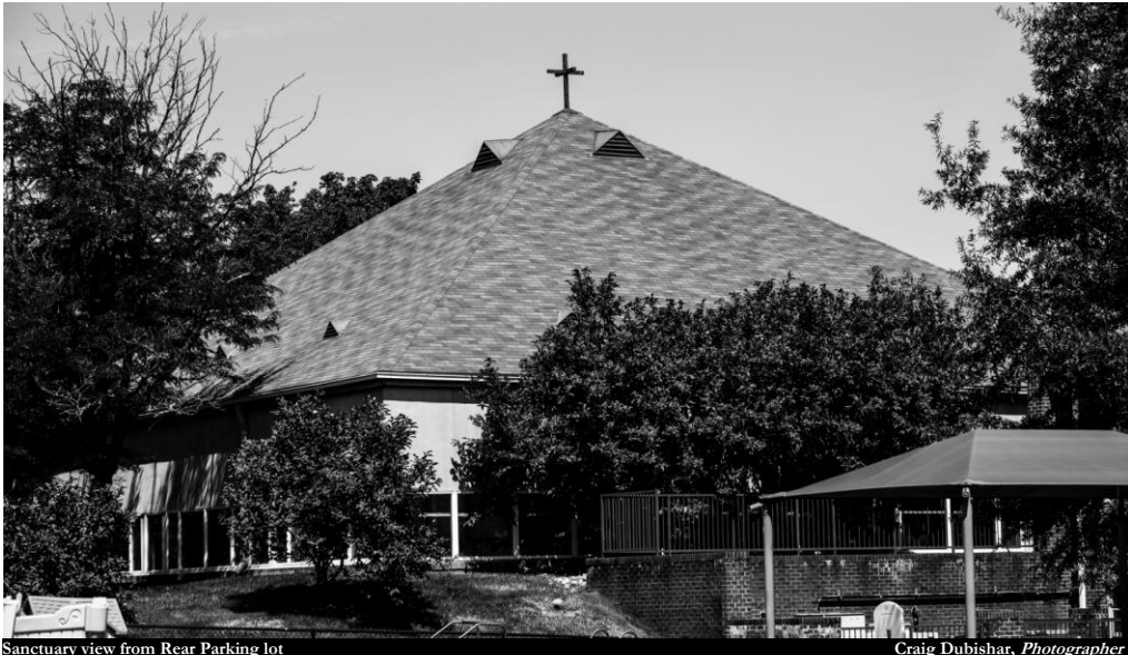
Sanctuary view from Rear Parking lot