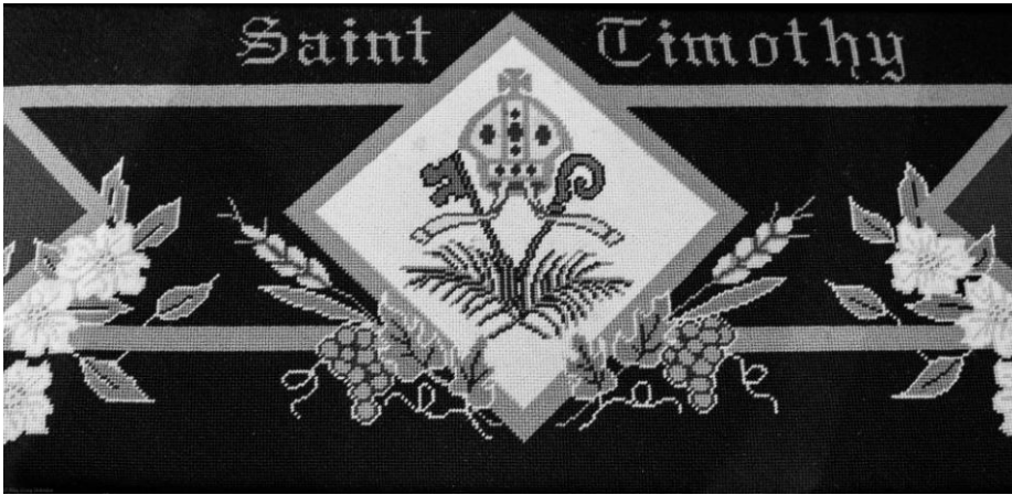
Saint Timothy Hand Sewn Kneeler