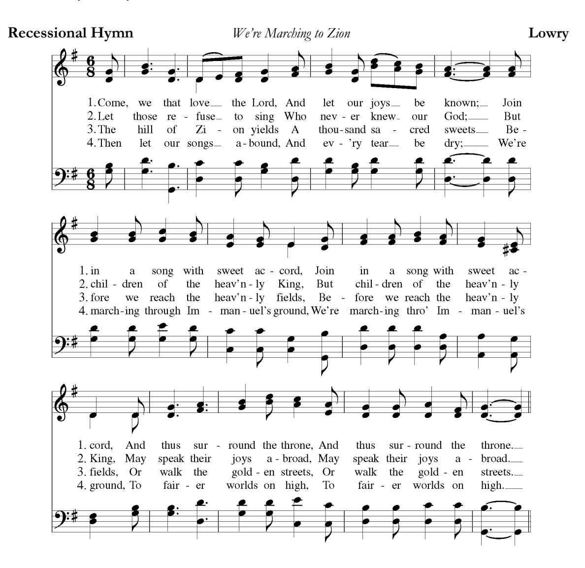
(chorus is on page 10)

Priest May the Sun of Righteousness shine upon you and scatter the darkness from before your path; and the blessing of God Almighty, the Father, the Son, and the Holy Spirit, be among you and remain with you always. Amen.