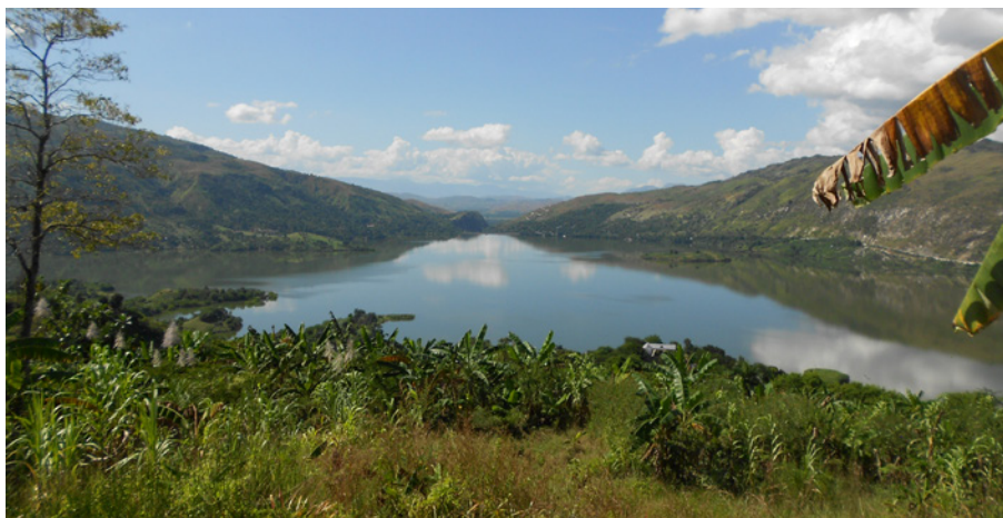
View of Lake Pelig, which cuts the village of Chapoteau off from major roads and cities in Haiti

I believe that our visit was successful, but much of His work in Chapoteau remains to be done. The success of the water system provides the example. Partners in the U.S. made its repair possible, and now the village has taken on the responsibility of maintaining it. Forming self-sustaining systems that provide access to all levels of the education cycle to secure better than subsistence level living remains an objective worthy of our attention and support. +