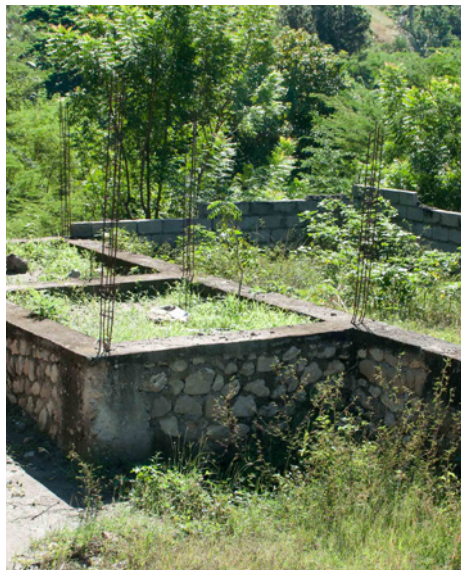
The foundation of the kitchen; the teachers tell us it’s the #1 priority