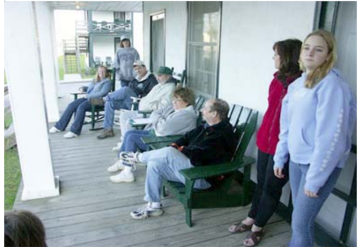
Friday's welcome gang-committee

Please enjoy looking over the photos of our adventures, moments and happy faces.