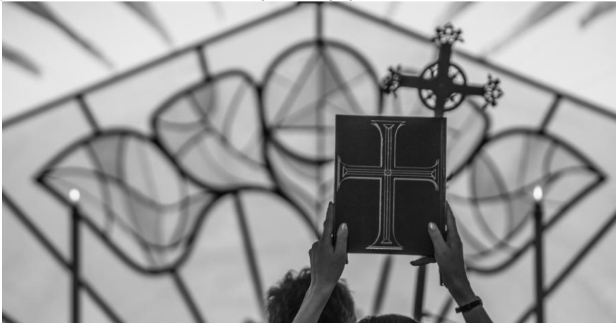
The Gospel Book Lifted High