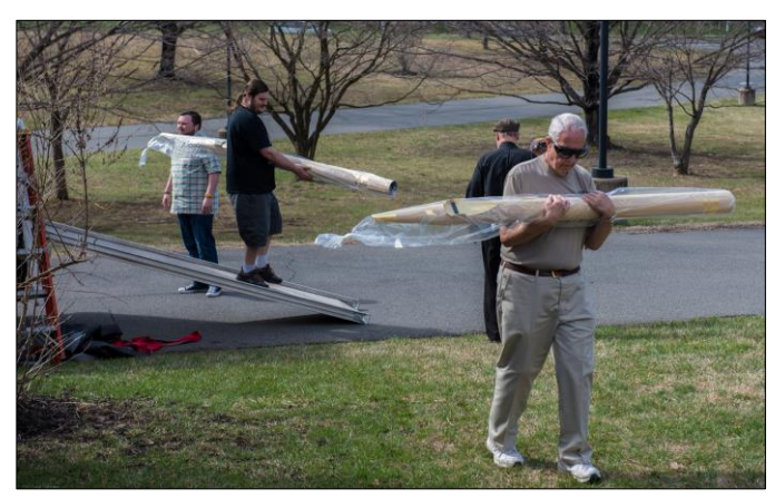
Piece by piece, the organ is brought in.