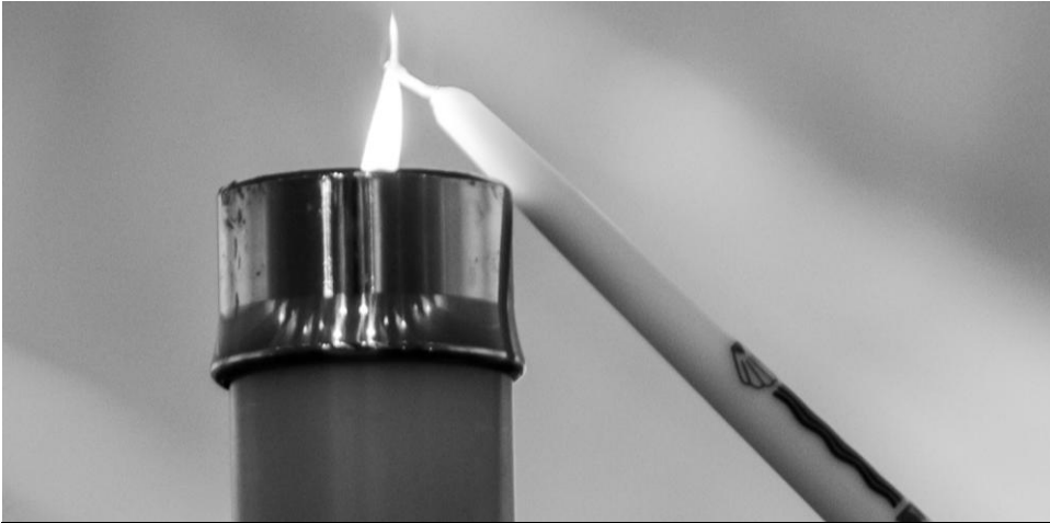
Lighting of candle