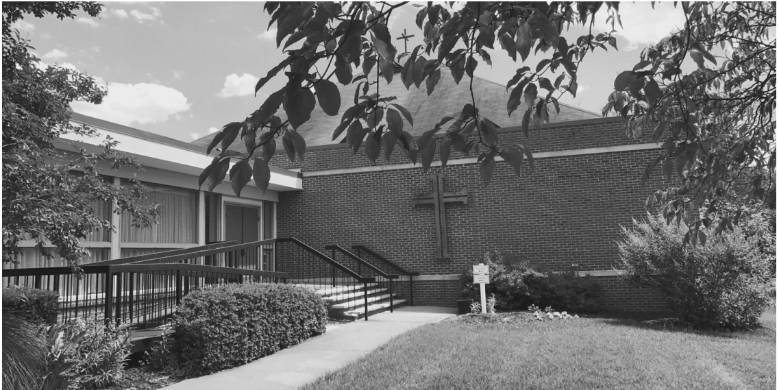
Outside Sanctuary Cross