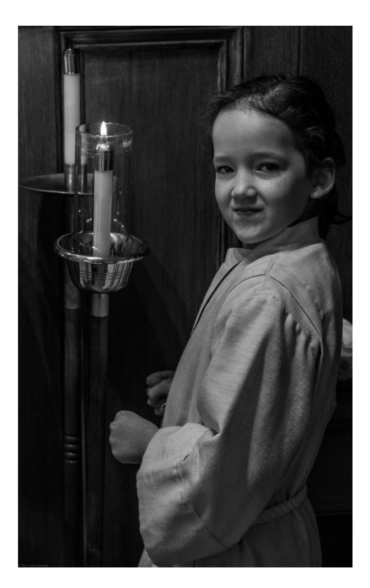
Creating a Sustainable Church- Ensuring St. Timothy's will be around for another 150 years